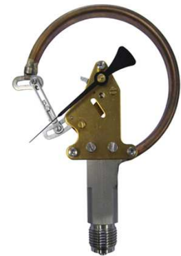
Internal of PBX-CAISSON